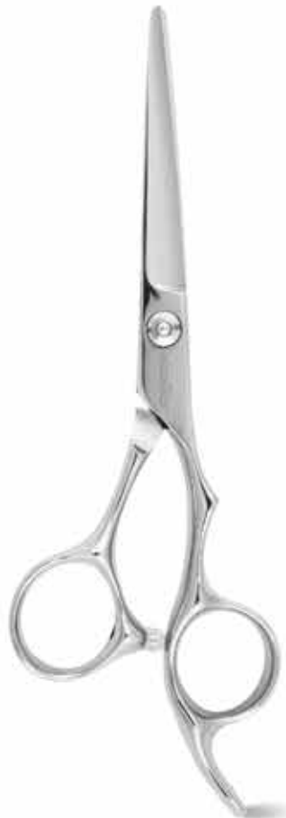
F2 - 55 5.5 Inch