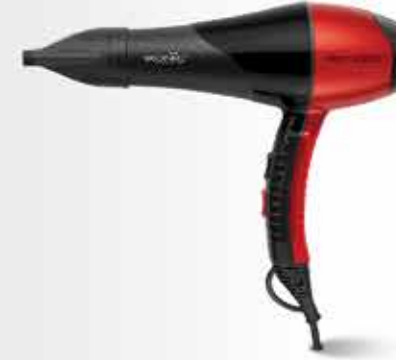
PRO 2200 Page No 11