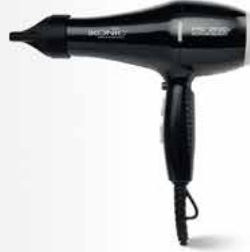
PRO 2500+ ADVANCED Page No 9