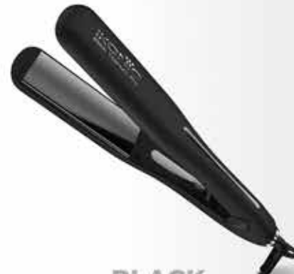
BLACK TITANIUM PRO