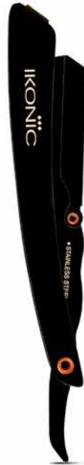
Black Material - Metal