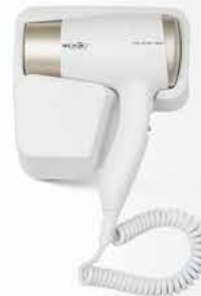
PRO 1500 Page No 15