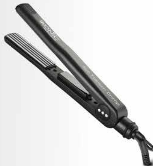
SLIM TITANIUM CRIMP