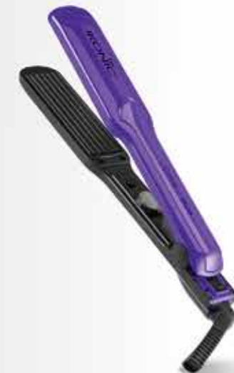
CRIMP & STYLE