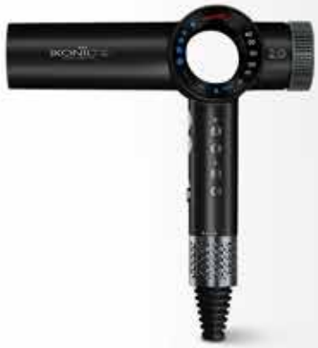
ID 2.0 Page No 4