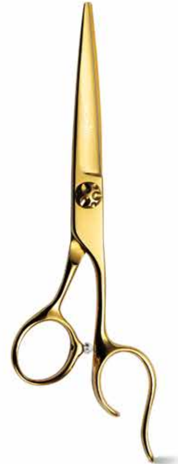
IKTC - 100 6 Inch