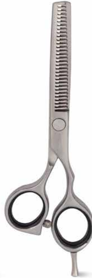
S - 53 6 Inch