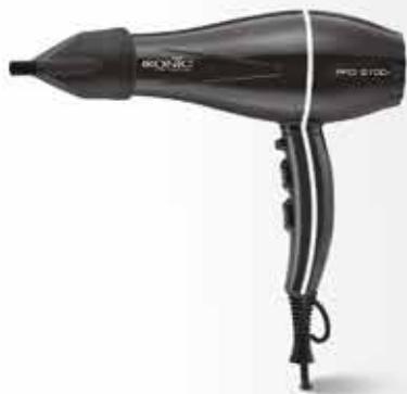
PRO 2100+ Page No 13