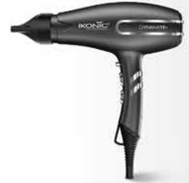
DYNAMITE+ Page No 7