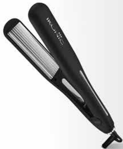
PRO TITANIUM CRIMP