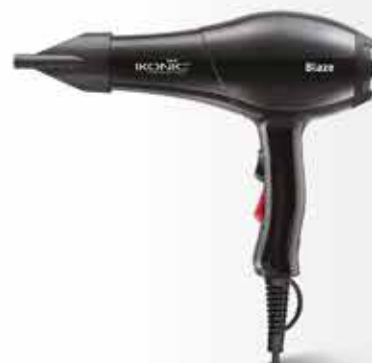
BLAZE Page No 14