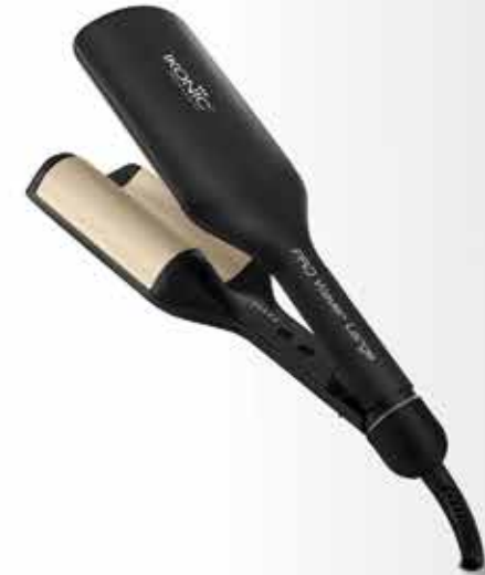
PRO WAVER LARGE