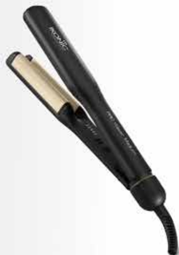
PRO WAVER MEDIUM