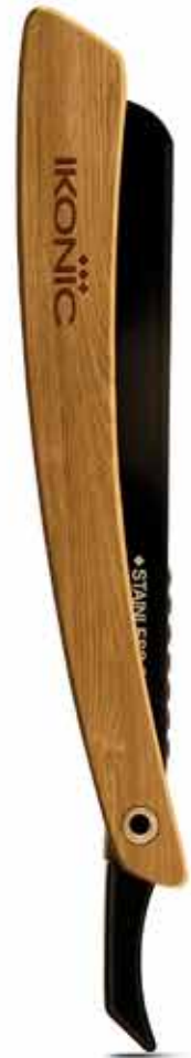
Brown Material - Wood