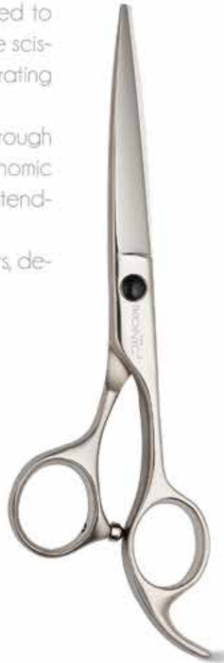
F - 160 6 Inch