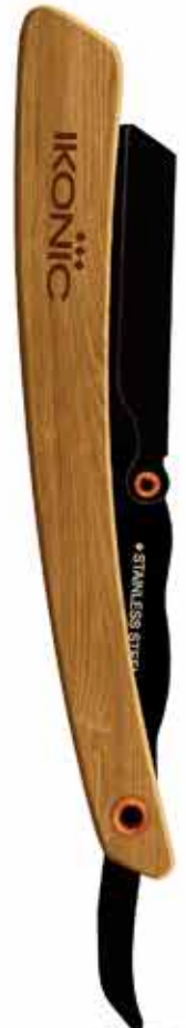
Brown Material - Wood