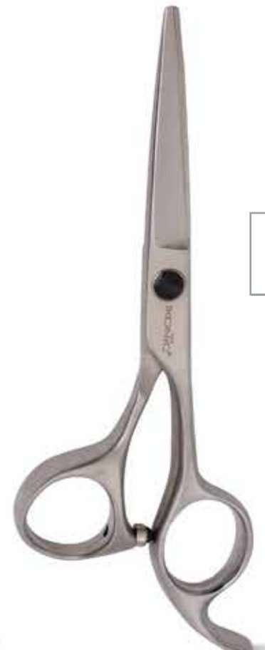
F - 55 5.5 Inch