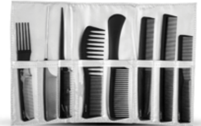
With a Free Pouch