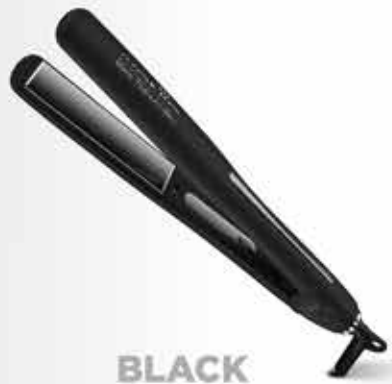
BLACK TITANIUM SLIM