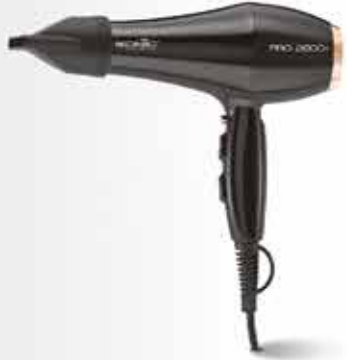
PRO 2800+ Page No 8