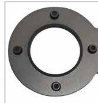
SILICONE Padding Base