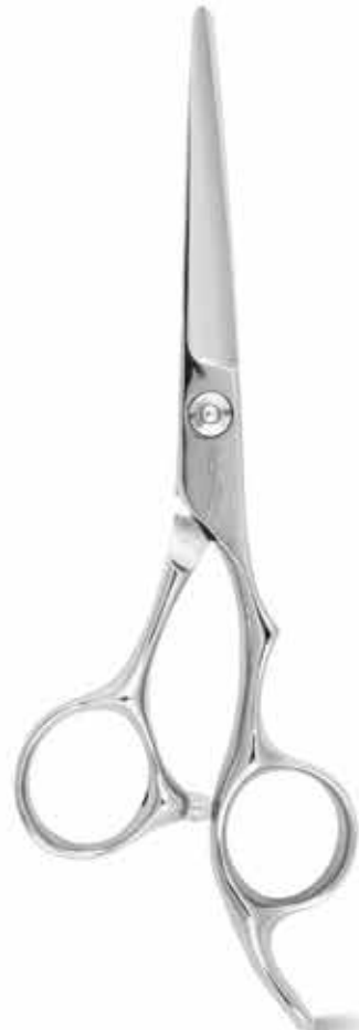
F2 - 60 6 Inch