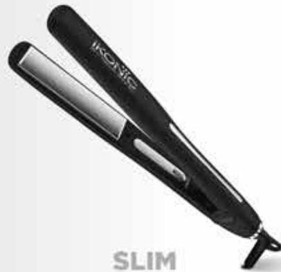
SLIM TITANIUM SHINE 3.0