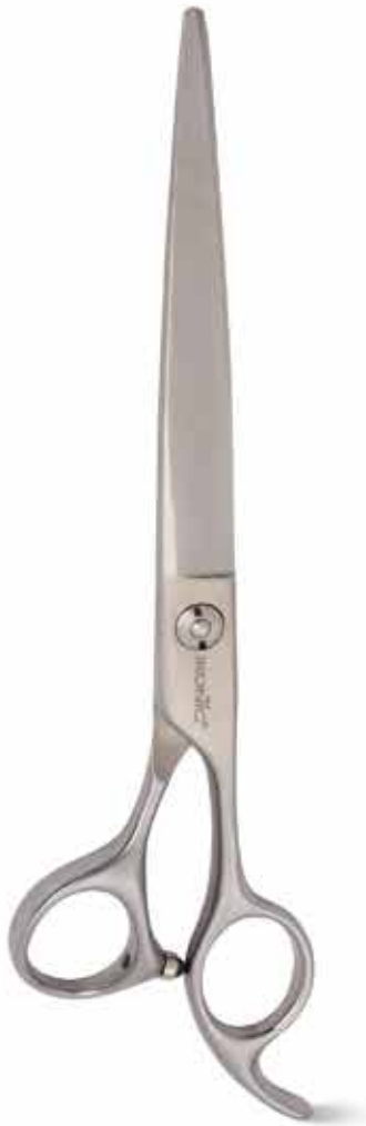
F1 - 70 7 Inch