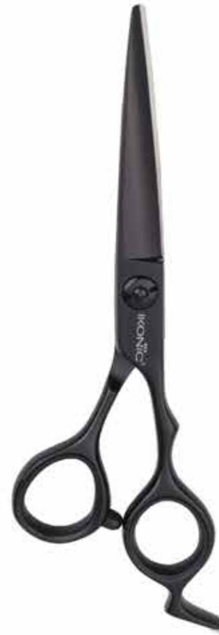
B - 55 5.5 Inch