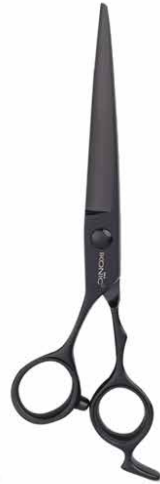
B - 60 6 Inch