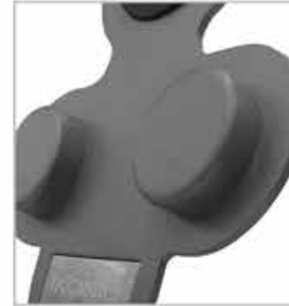
MAGNETIC Nozzle Holder