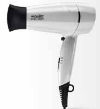
PRO 1800 Page No 16