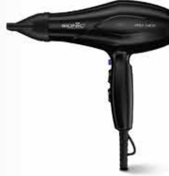
PRO 2400 Page No 10