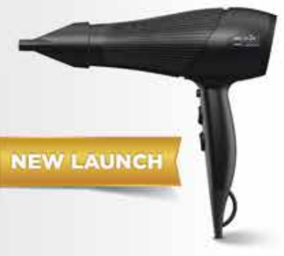
PRO 2200+ Page No 12