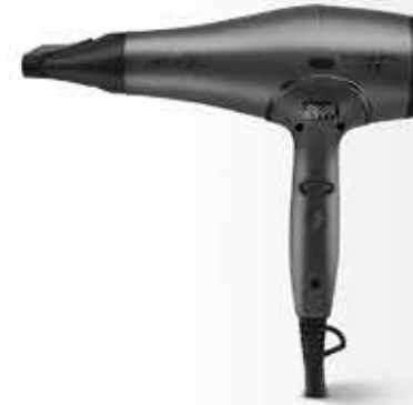
FINISHING LINE Page No 6