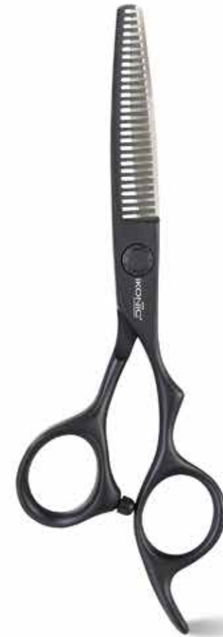
IKMR - 205BT 5.5 Inch