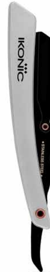
Silver Material - Plastic