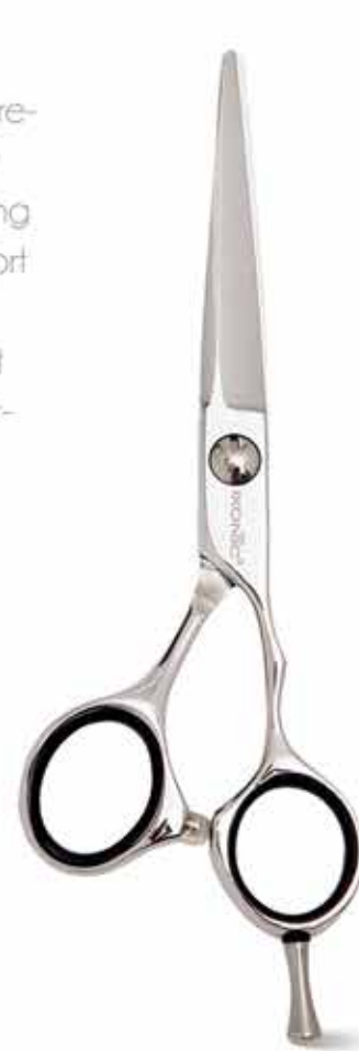
G - 55 5.5 Inch