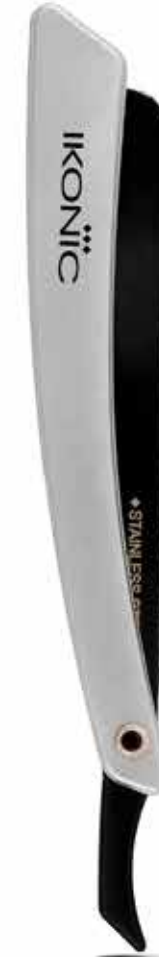
Silver Material - Plastic