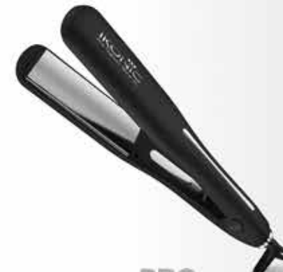
PRO TITANIUM SHINE 3.0