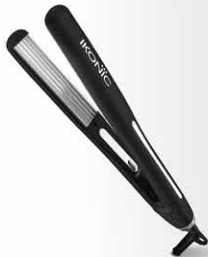
SLIM TITANIUM CRIMP 3.0