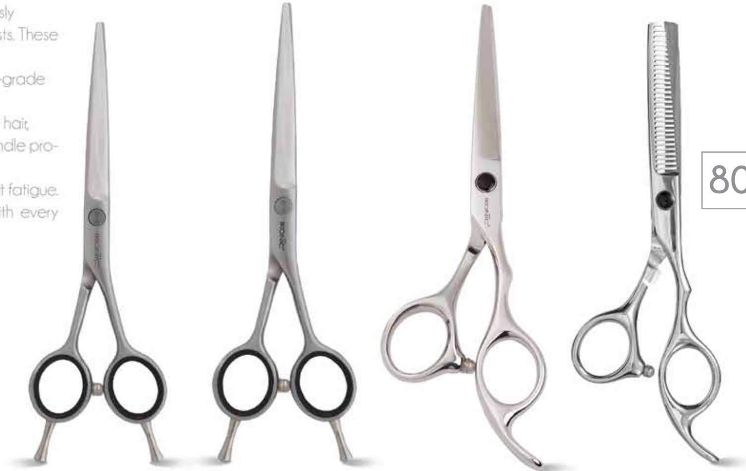
A- 55 5.5 Inch

Introducing the Academy Line Hair Cutting Scissors, meticulously crafted to meet the demanding needs of professional hairstylists. These scissors are engineered with precision and excellence, incorporating top-grade materials and advanced design features. The ultra-sharp stainless steel blades effortlessly glide through hair, ensuring clean and precise cuts every time. The ergonomic handle provides optimal comfort and control, allowing for extended use without fatigue. Experience effortless precision and superior performance with every cut.