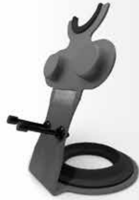
ID 2.0 STAND Page No 5