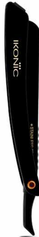
Black Material - Metal