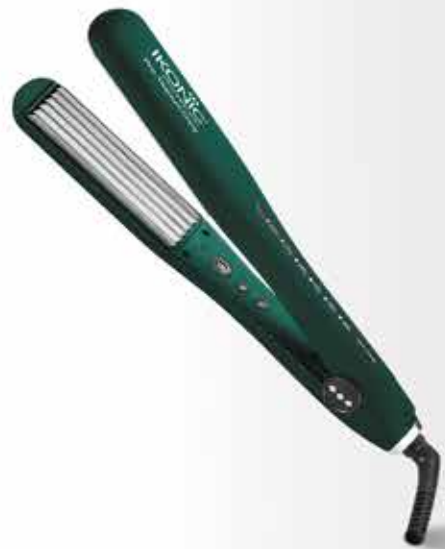
PRO TITANIUM CRIMP