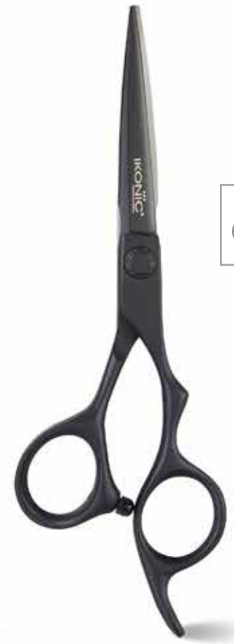
IKMR - 205B 5.5 Inch